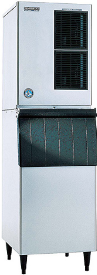
KM-650MAH + B-301SA